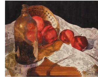
Lace Reflections - Jackie Stein