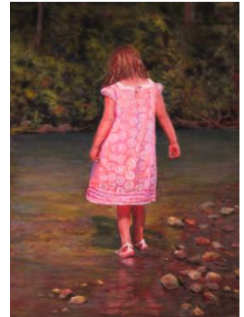
Nyad – Karen Israel