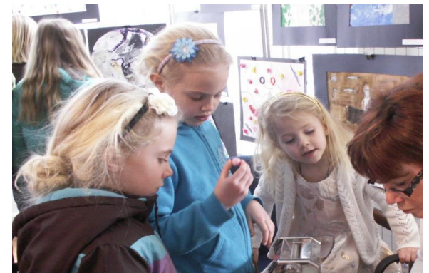
Annual School Student Art Show