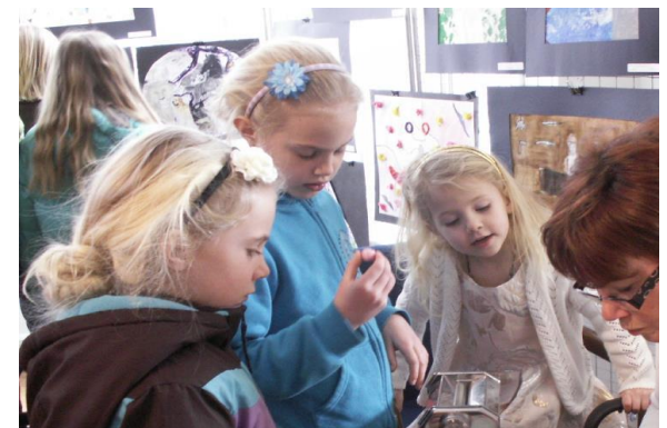
Annual School Student Art Show